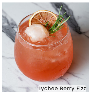
Lychee Berry Fizz