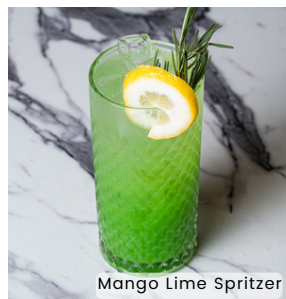
Mango Lime Spritzer