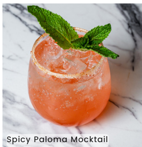
Spicy Paloma Mocktail